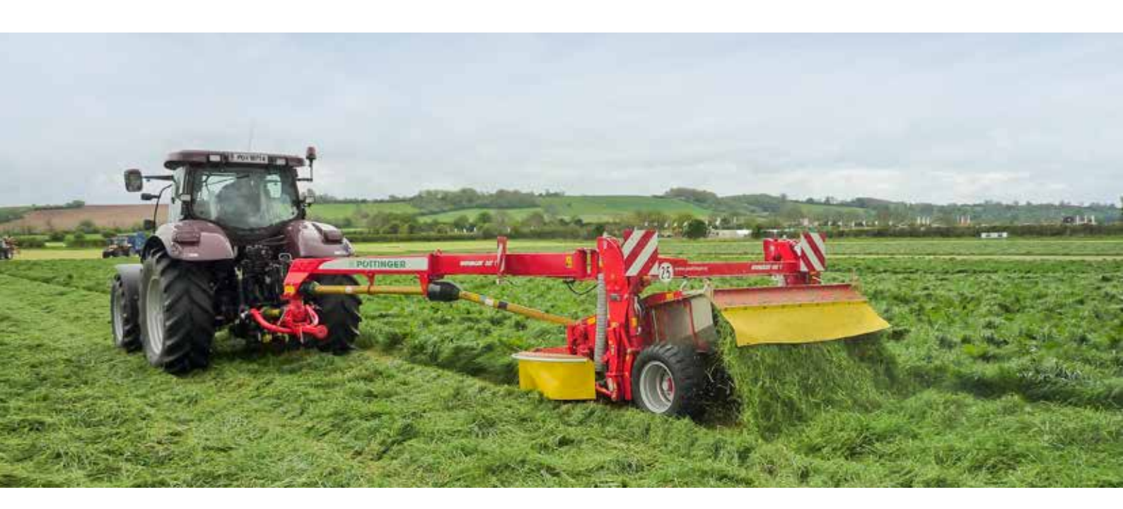
Our NOVACAT T trailed mowers with a working width of 3.04 m / 3.46 m are ideal for mowing with small tractors. On the trailed version with chassis, you do not need any lifting power, so you can also use lower power tractors. This helps you save fuel.